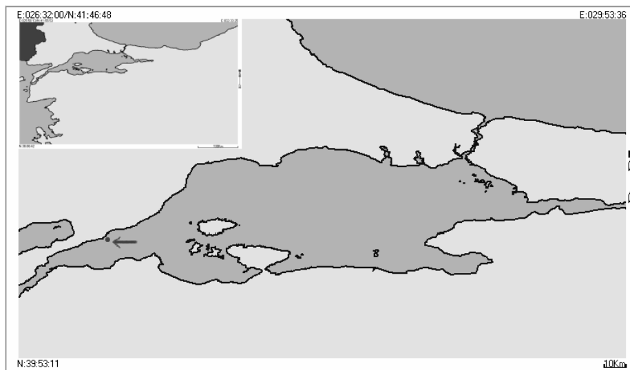
Fig.1 The sampling point of Medorippe lanata in Sea of Marmara

The specimen were fixed and preserved in 5% formalin solution. Sample has been identified, photographed and conserved privately. (Fig.2a picture, Fig.2b drawing)