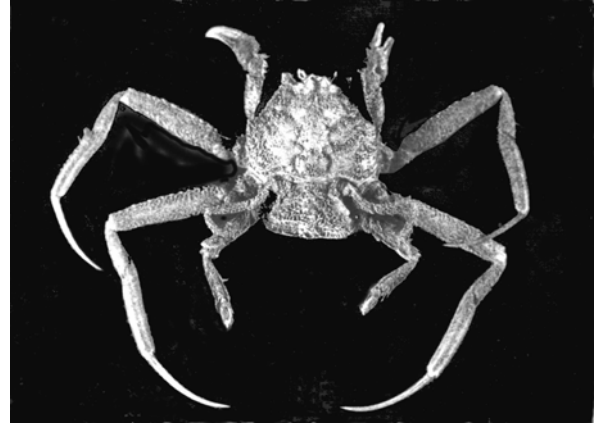
Fig.2a. Picture of Medorippe lanata (Artüz)

Also because of the geological situation of the area there are varieties of divergence and convergence currents. In this connection, the salinity values of the area are variable (Sal ‰24 to Sal ‰38). The area is one of the mixing areas of Mediterranean originated water (Sal ‰38.) and Black Sea originated-Sea of Marmara water (Sal ‰24).