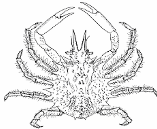
Fig.2.- Maja goitziana

Acknowledgment: We thank to the beam-trawlers of Kavak village for kindly and helpful co-operation.